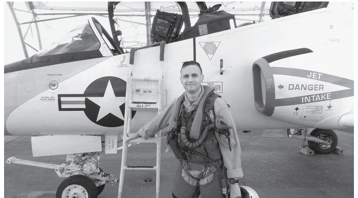
My first solo flight in a jet