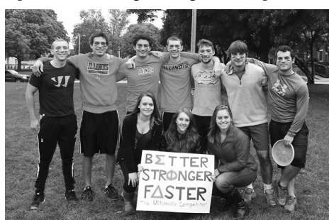
Brothers with Sigma Kappa sisters at the sorority's Ultimate Frisbee philanthropy tournament.

Delta Chapter is pleased to report that we achieved a cumulative chapter GPA of 3.10 last semester, ranking in the top 10 for fraternities. We also had four students earn a perfect 4.0 in engineering. The chapter