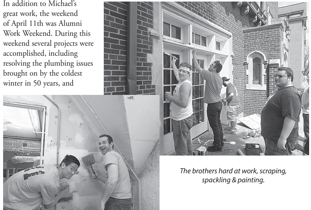
The brothers hard at work, scraping, spackling & painting.

Alums would like to reward the hardworking pledges and undergraduate brothers by replacing and updating the French doors in the front of the house; the dollars donated by alumni like you help bring in more actives by keeping the house looking great.