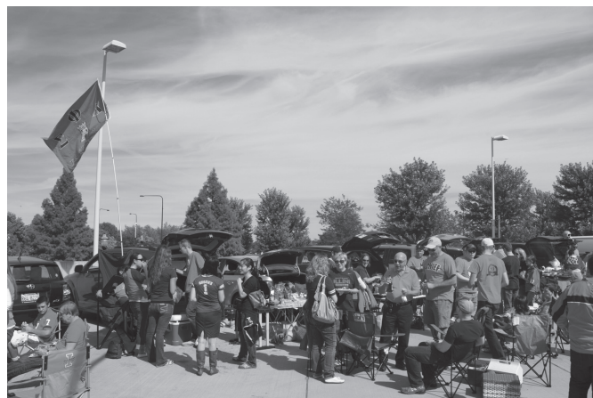
Overall view of tailgate before the game

302 E. Gregory. Gary brought along some great photos of the chapter house during that time—a future newsletter will feature these photos and a story of the move to today's chapter house.