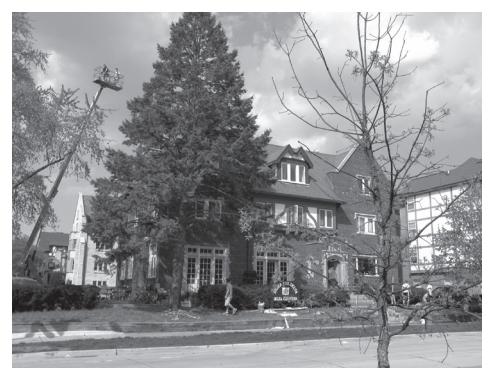
A picture from last year's Alumni Work Weekend showing the 60-foot boom lift we rented to clean the gutters and repair and paint the trim and eaves.