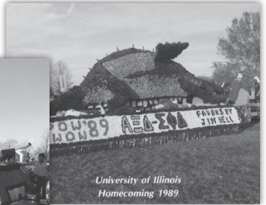
Check out the spikes on this float from 1989.

This year, Delta Alumni celebrated the 100th Homecoming at the University of Illinois. Take a look at these photos from homecomings past. If you have homecoming memories and photos to share, send them to our editors at alumninews@affinityconnection.com (mention Sigma Phi Delta at Illinois).