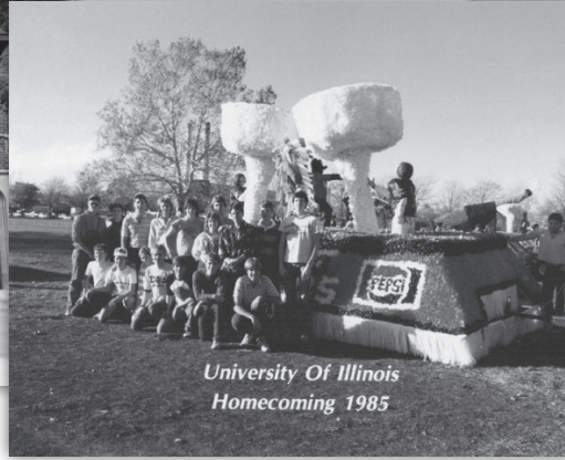
Brothers show off a Pepsi-themed float in Homecoming 1985.