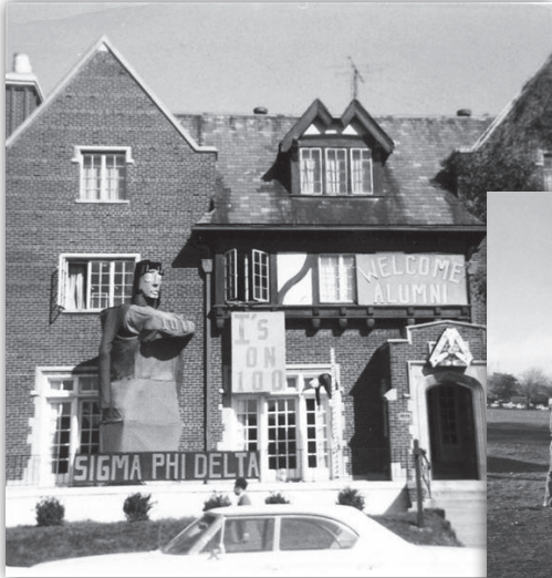
In this photo from 1967, returning alums received a "larger-than-life" welcome.