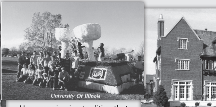
Homecoming is a tradition that continues to create memories! This photo was taken during 1985 Homecoming.