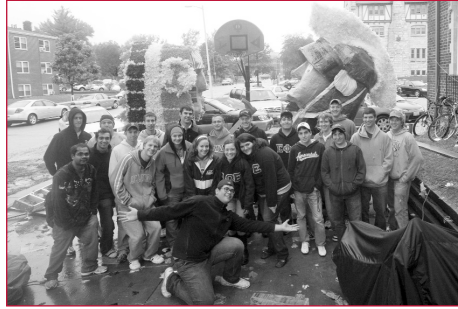
The Active Chapter in front of the great float we built for the Homecoming parade. Unfortunately, the parade and float competition were canceled due to inclement weather.

We have also hosted or participated in many events this semester to strengthen our professional and social involvement with the campus. We once again built a float for the annual homecoming parade. Unfortunately due to the inclement weather the parade and float competition were cancelled, but we surely would have avenged their second place finish from last year had the competition gone on. Following the success of last spring semester's professional event, the chapter house hosted another one this year with the active members of our sister sorority Alpha Omega Epsilon.