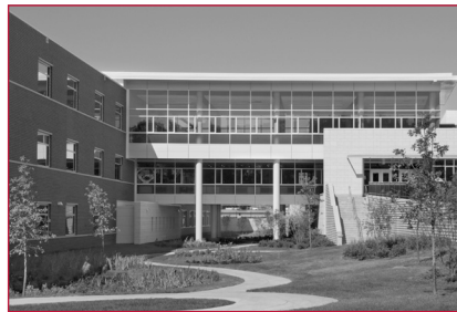
Front of the Hubble Middle School looking west: classroom wing at left, "bridge" with library on top level at center, main entry at right.

This $50 million, 200,000 square foot building is the home of the College's technology-based programs including: Automotive, Welding, Manufacturing, HVAC/R, Construction, Horticulture, Electronics, Architecture, and Interior Design. The building was already engineering-intensive due to the technical programs it houses, but Leesman's team added another layer of complexity by designing with sustainability in mind. "We designed a 3 megawatt substation in the building based on worst case electric usage, but our true goal was for the building to never need that capacity." This goal was achieved, and the building is pending Silver