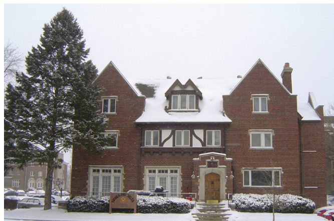
A sprinkler system was installed in the chapter house over the summer, thanks to a recent refinancing of our mortgage. Champaign building codes required the installation to be complete by fall 2009.

Here's wishing you all the best in 2009!