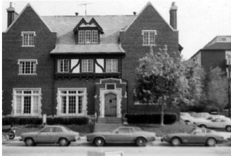
An undated photo shows little has changed on the outside of the house

For 45 years, 302 East Gregory Drive has been the home of Delta Chapter. The construction date of the house is not known, but it is estimated to have been built in the late 1920's, coinciding with a fraternity boom at Illinois and across the nation.