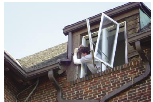
Tom Dagenais replaced wood on the third floor dormer windows.

After the meeting the remainder of the projects were wrapped up. Several Brothers headed back home while some lingered around for the afternoon checking out the changes on campus and remembering the good times as an undergrad.