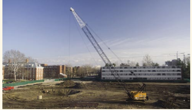
Ongoing construction continues to change the view from the house.

We would like to offer a special thanks to the alumni who worked hard with us to complete most projects during Alumni Work Weekend.