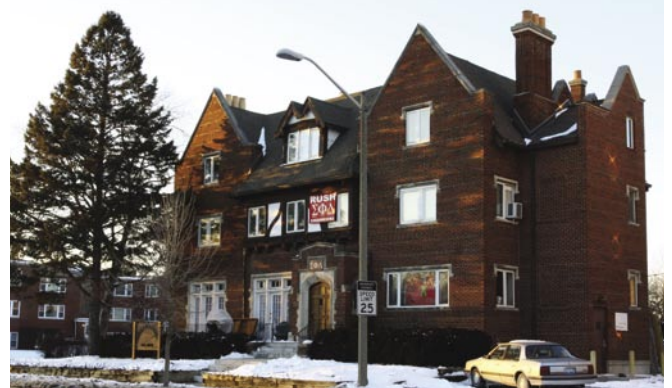
The Delta Chapter House Today

As the condition of the house degrades, recruitment becomes more difficult. Currently, the majority of our funds go to fix code violations or basic repairs, which has left us struggling to provide the updates needed to keep up with other campus housing options. Despite these challenges, our outlook remains strong. Just as we have kept the brotherhood of Delta Chapter strong for 80 years, we are committed to keeping our Chapter House strong. With your help, Third and Gregory will long be known as the home of Illinois' finest engineers.