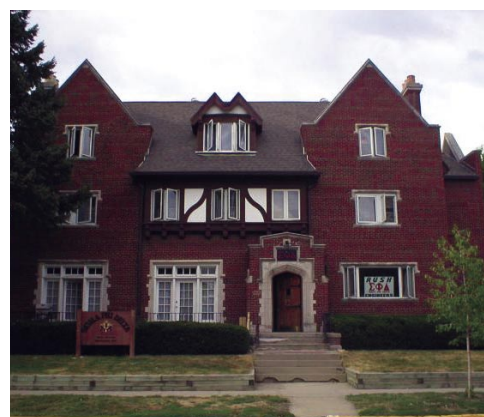
The Sigma Phi Delta house is in need of renovations, including the required installation of a fire suppression system by 2009.

needed renovations. Further discussions on this topic will take place at our January alumni meeting. Stay tuned to our monthly e-letters and our website for meeting details.